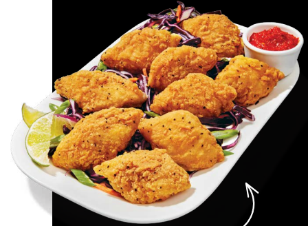
INNOVATIVE HAND-HELD APPS