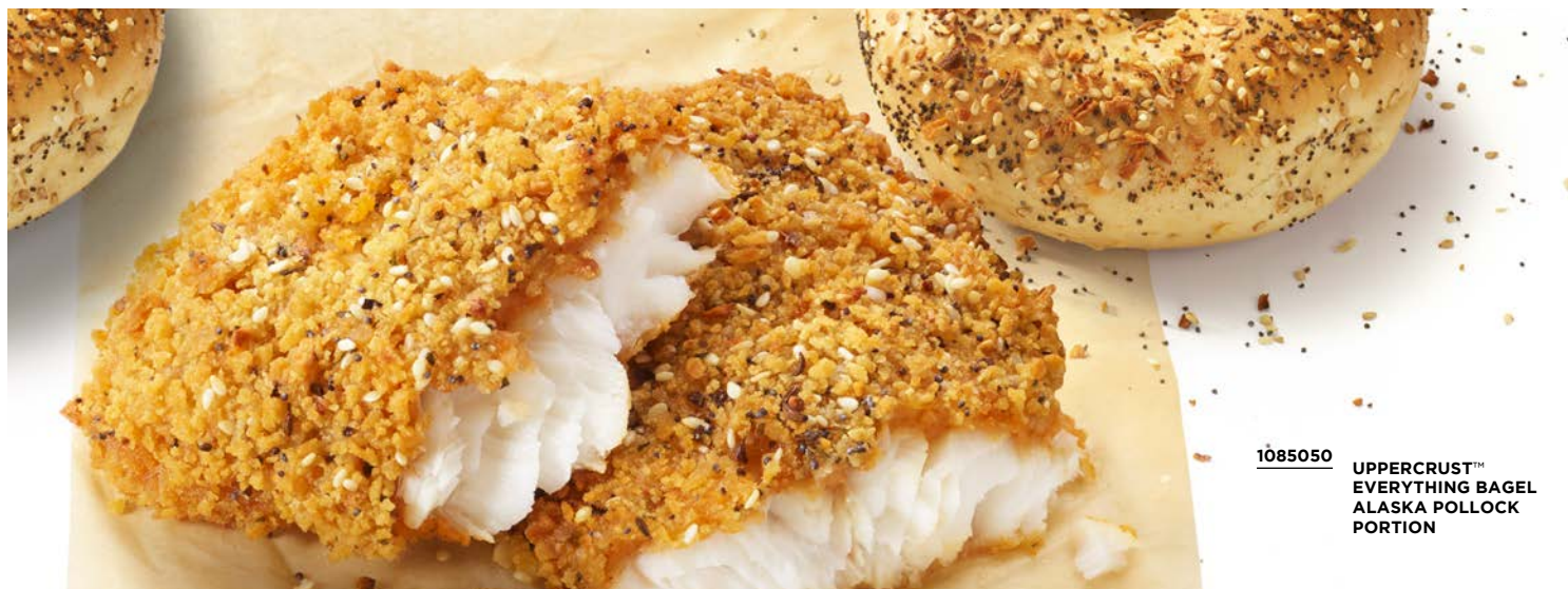
1085050 UPPERCRUST™ EVERYTHING BAGEL ALASKA POLLOCK PORTION

DF: Deep Fry FA: Forced Air Convection Oven MW: Microwave OR: Oven Ready PS: Pan Sear RT: Retherm