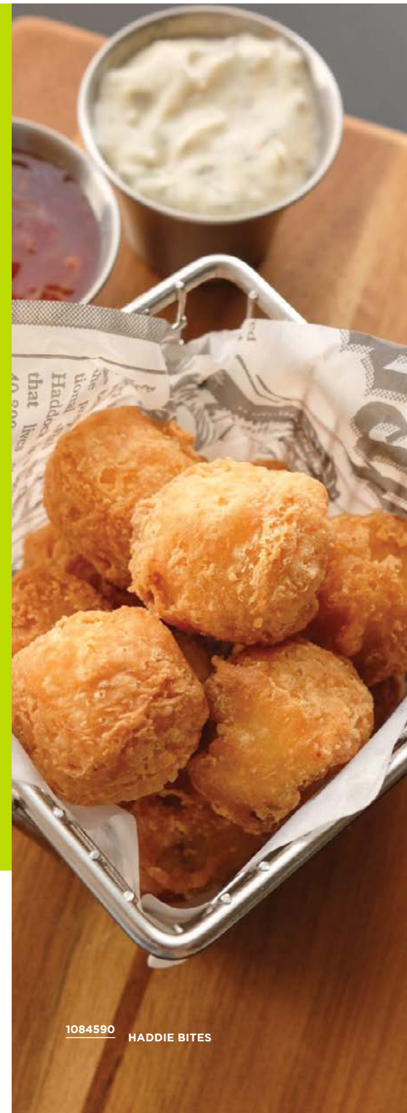
1084590 HADDIE BITES